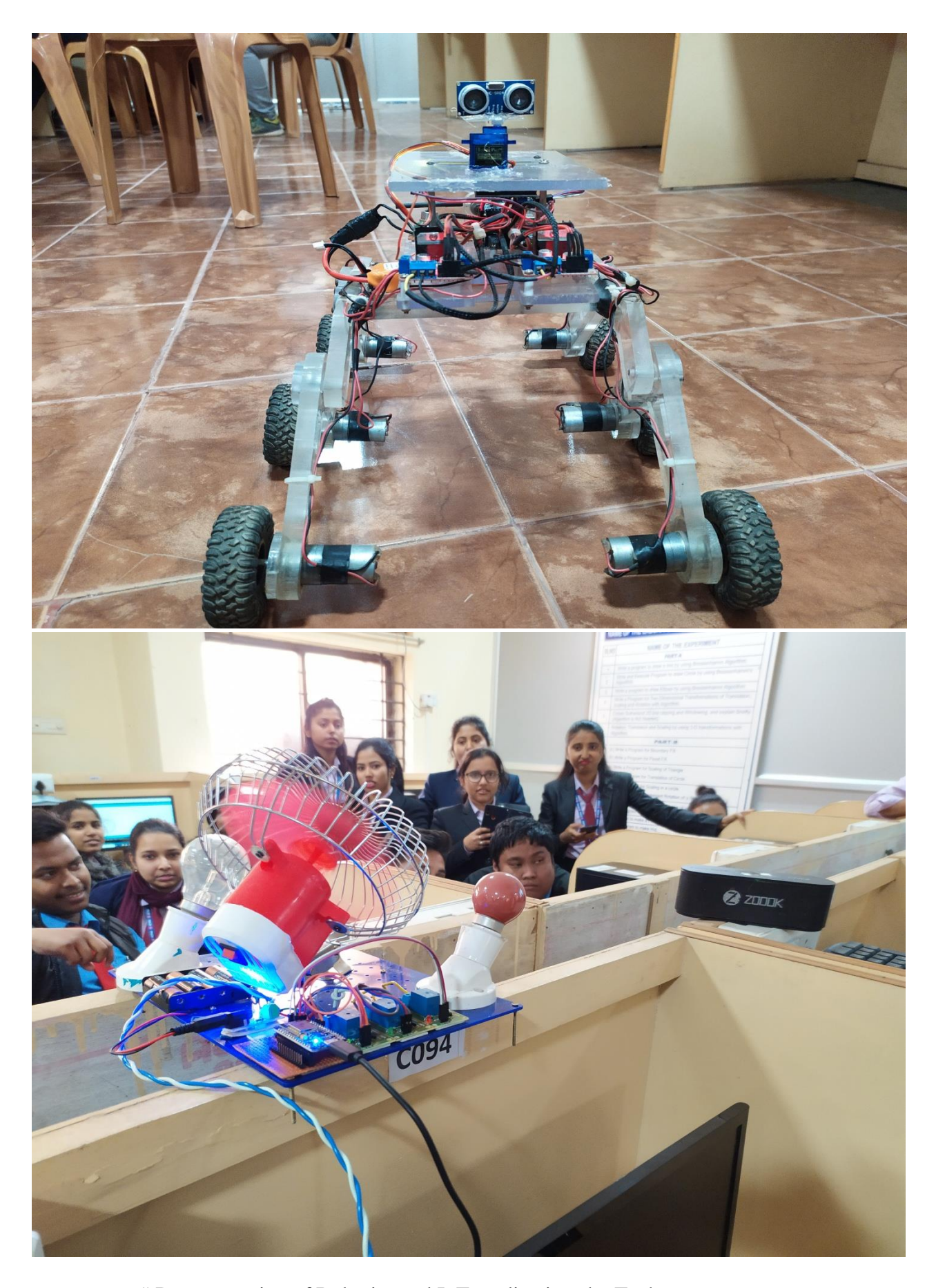
# Demonstration of Robotics and IoT applications by Technomate persons