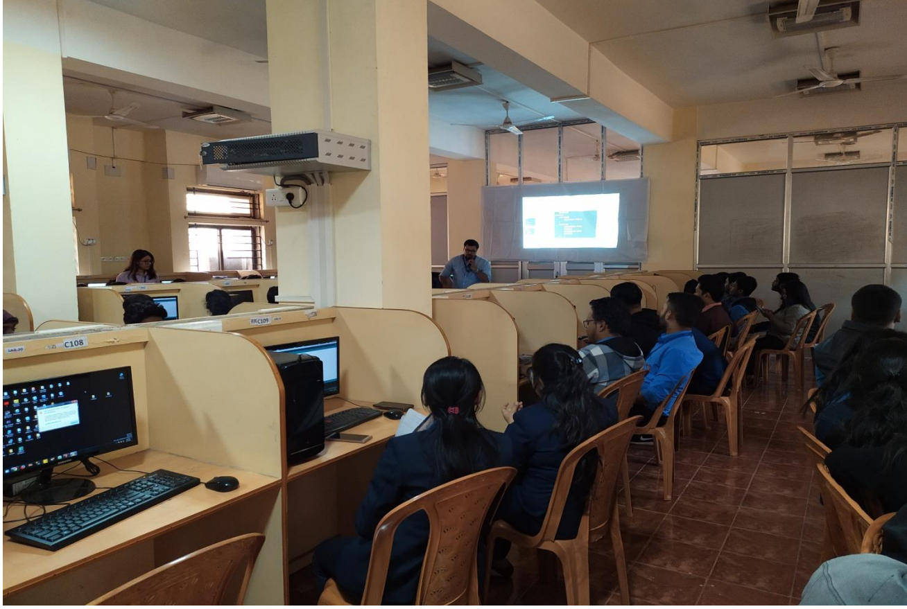
# Technical sessions of two complete days were conducted at Computer Lab 4. Around 65 students participated in this hands-on workshop