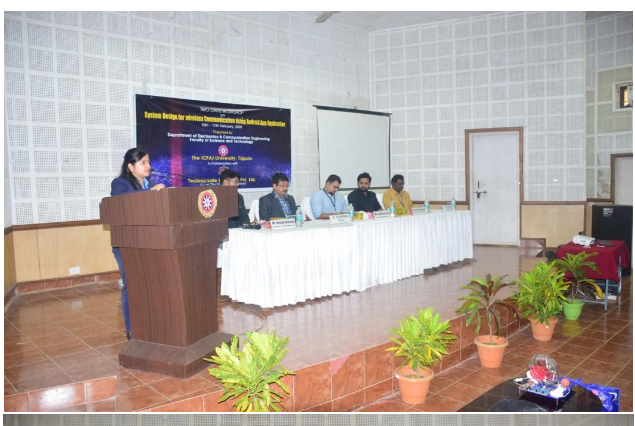
Two days Workshop On "System Design for wireless Communication Using Android App Application" organized by the Department of Electronics & Communication Engineering in collaboration with Technomate Edubotics Pvt. Ltd. -10<sup>th</sup> & 11<sup>th</sup> February 2020