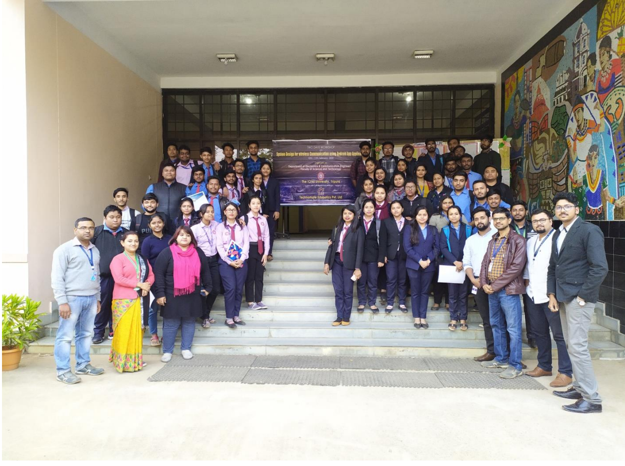
# Certificate distribution to the participants by Technomate # Group photo at the end of the workshop in front of IUT academic building