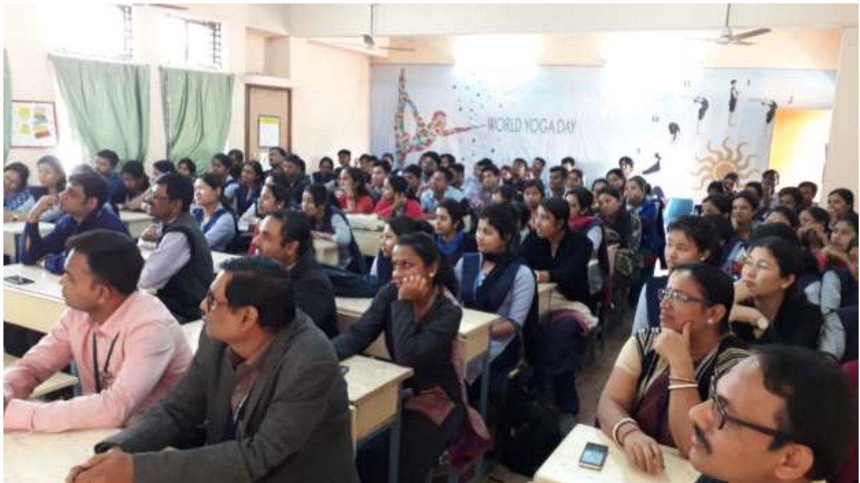
Participation of Faculties' and Students for the programme