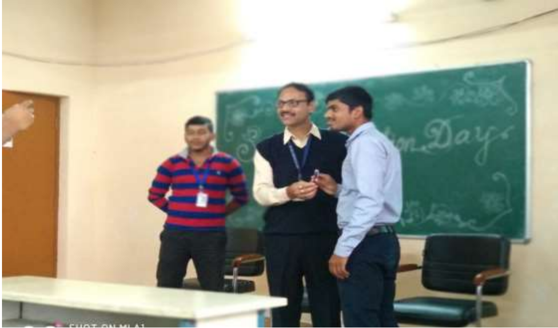
Prize Distribution of competitions