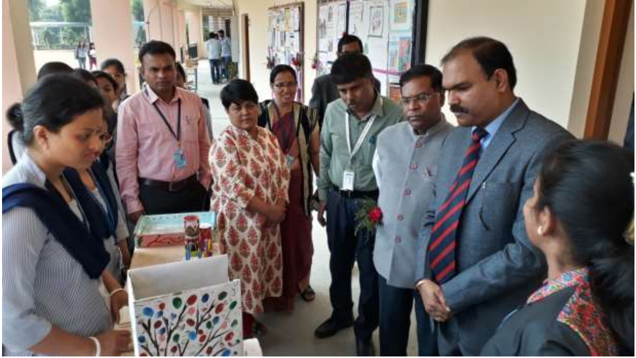
Teaching Learning Material Presentation by Teacher Trainees D.ED-SE-MR Students