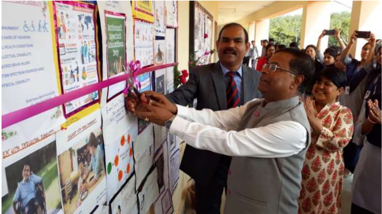
Display of Poster Exhibition and Wall paper Magazine by FoSE&R Students