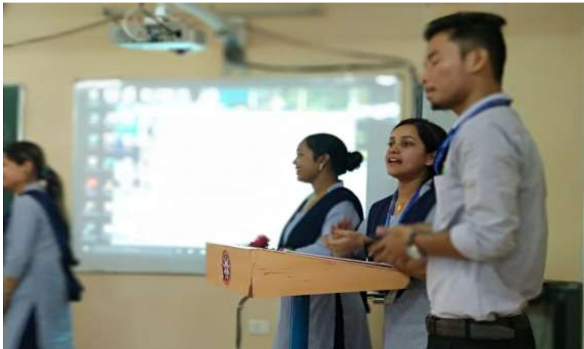
Quiz Competition on Special Education Day organised by Teacher Trainees