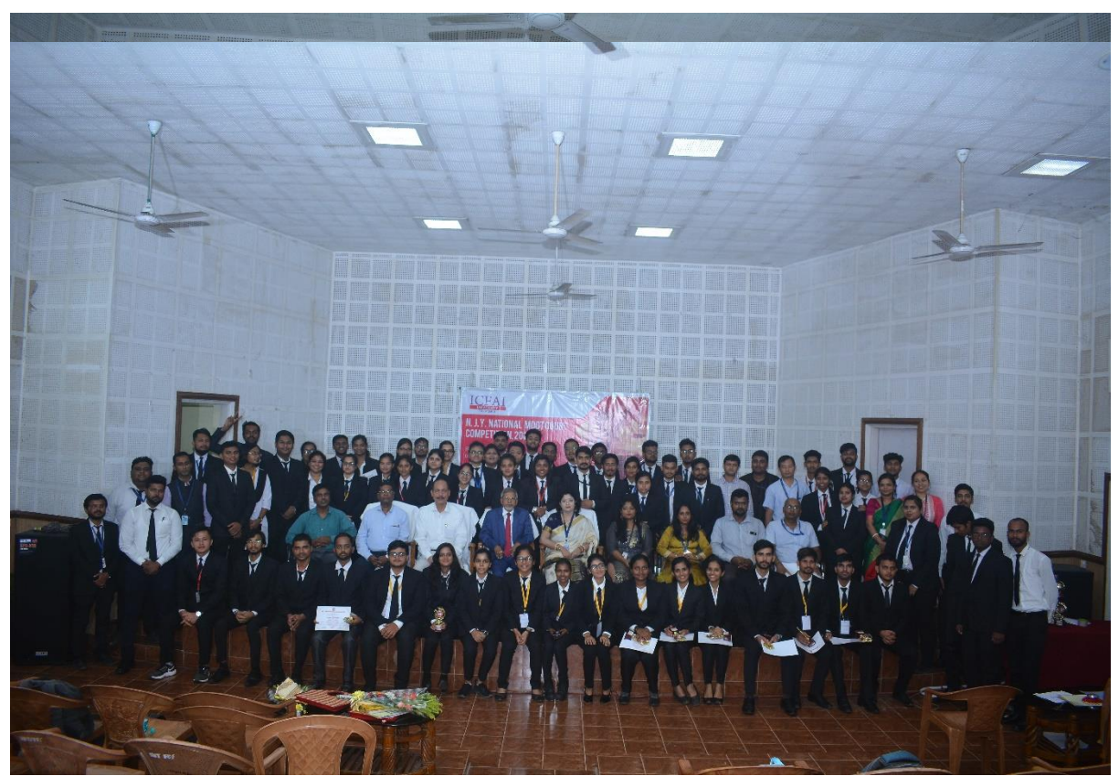
Group Photograph of Valedictory Ceremony.