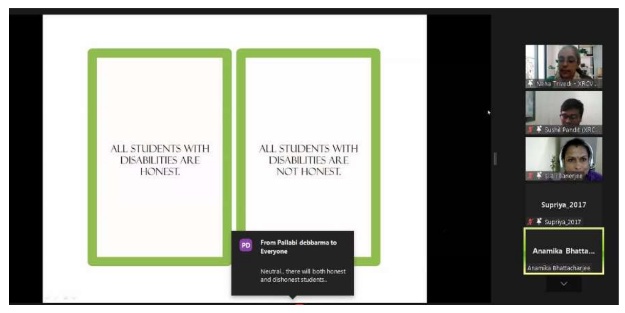
Interaction during Online Session...