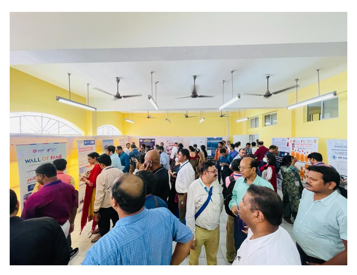
IIC regional meet- Poster gallary