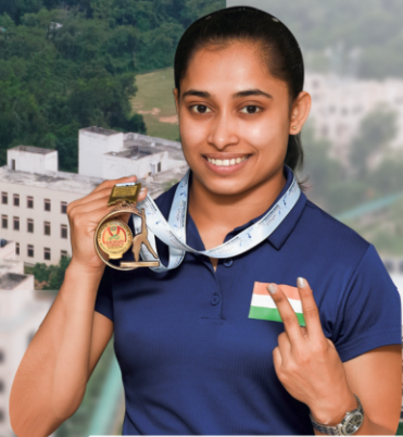
Padma Shri DIPA KARMAKAR Brand Ambassador, IUT